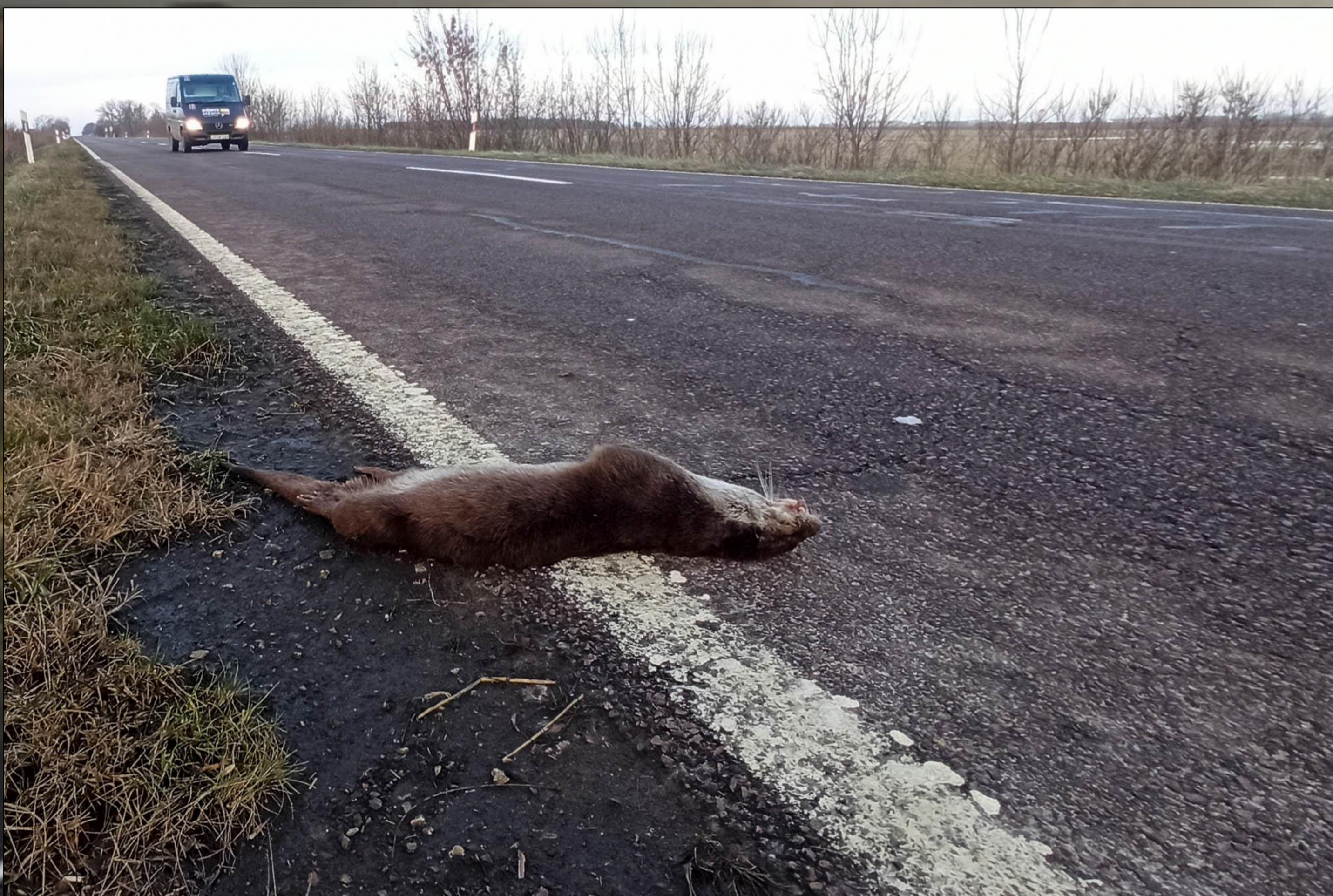
Figure 1. A strictly protected Eurasian otter hit by car.

After legal harvesting, the second largest cause of human-induced mortality in vertebrates is the animal-vehicle collision. The amount of roadkilled birds are 194 million individuals per year, while this number in mammals are 29 millions. Country-level estimates of roadkilled animals are available in the international literature from several parts of the world, but not from Hungary. As a result, Hungary often indicated as a blank space in review papers, however, regional publications from 1978 to nowadays are available.